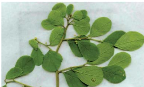
S. leucopyrus (Willd.) Muell.-Arg.