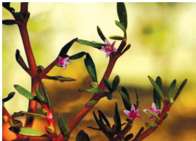
S. portulacastrum (Linn.) Linn.