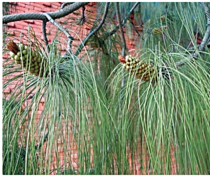
P. roxburghii Sarg.