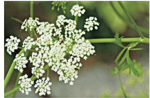
P. anisum Linn.