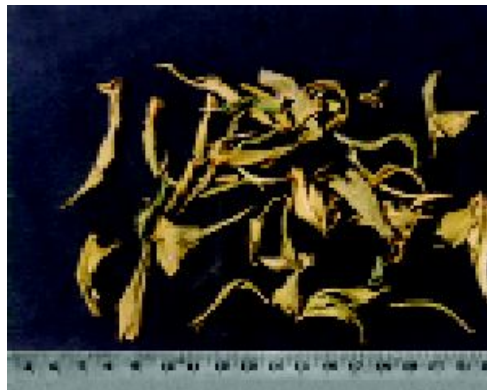
B. Dried leaves