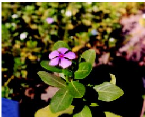
A. Flowering branch

Drug consists of dried leaf of Catharanthus roseus (Linn.) G.Don (A & B) (syn. Vinca rosea Linn.; Lochnera rosea (Linn.) Reichb.) 1 ; Fam. Apocynaceae. It is an erect, everblooming glabrous, 30 to 60 cm high and grown as an ornamental herb. The plant has spread all over the tropical and subtropical parts of India, and grows wild all over the plains and lower foothills in northern and southern hills of India.