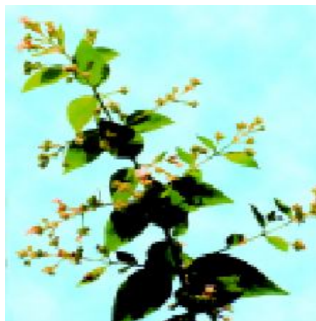
A. Flowering branch

Drug consists of the dried leaf of Nyctanthes arbor-tristis Linn. (A & B); Fam. Oleaceae. A small tree occurring wild in the outer Himalayan ranges from Kashmir to Nepal, and almost throughout India, up to 1000 m. Also cultivated in gardens and elsewhere.