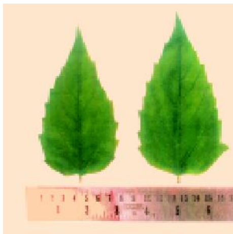
B. Dried leaves