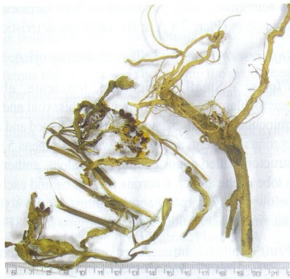
B. Fragments of whole plant