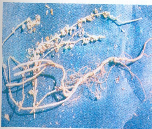
B. Dried whole plant