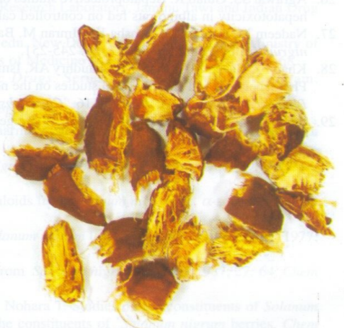
B. Dried split fruits