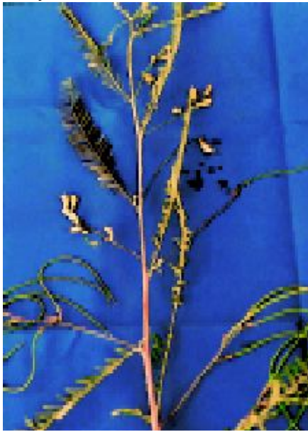
A. Flowering twig

Drug consists of dried pod of Sesbania bispinosa (Jacq.) W. F. Wight (syn. S. aculeata (Willd.) Poir.; Aeschynomene bispinosa Jacq.) (A & B); Fam. Fabaceae. A fast growing shrub up to 1.5 m high with 12-20 cm long linear pods; found in plains from the Western Himalayas to Sri Lanka.