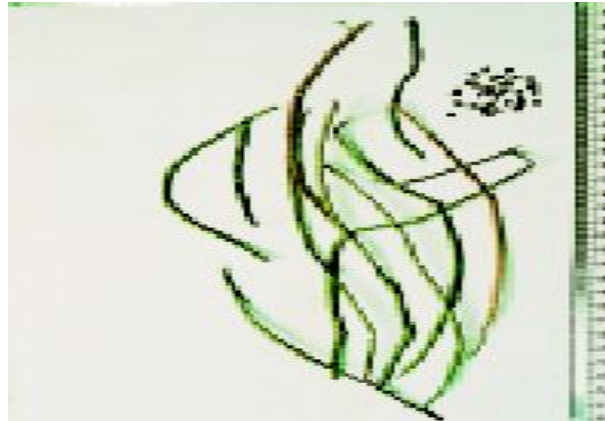
B. Dried pods and seeds