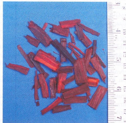
C. Wood chips