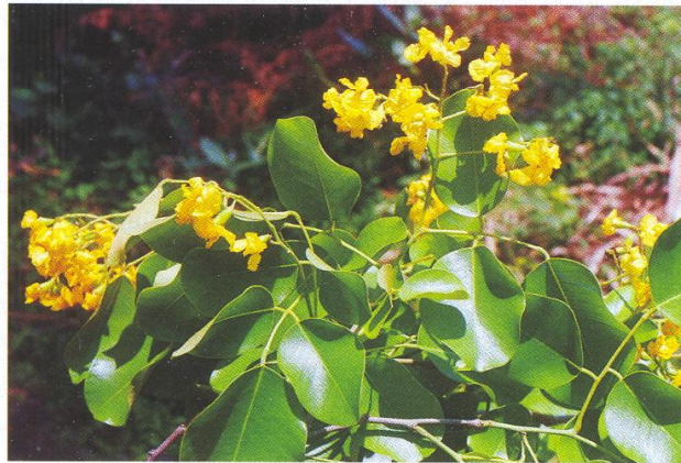
A. Flowering twig

Drug consists of dried heartwood of Pterocarpus santalinus Linn.f. (Plate 24.1 A, B & C); Fam. Fabaceae. It is a moderate sized deciduous tree, up to 10-11 m high and 1.5 m in girth, growing in Andhra Pradesh, Tamil Nadu and Karnataka upto 500m altitude.