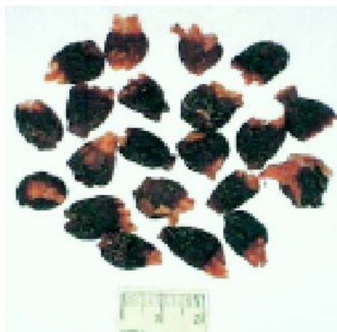
B. Dried fleshy corolla lobes