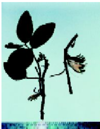
A. Twig and flowering branch

Drug consists of dried stem bark of Dendrophthoe falcata (Linn.f.) Etting. (syn. Loranthus longiflorus Desr.) (Plate 20.1 A & B); Fam. Loranthaceae. It is a large woody branched parasite growing on a great variety of forest and fruit trees, and distributed almost throughout India, up to an altitude of 2400 m in hills.