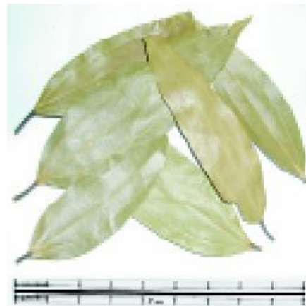
B. Dried leaves