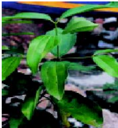
A. Leafy branch

Drug consists of dried mature leaf of Cinnamomum tamala (Buch.-Ham.) Nees & Eberm. (Plate 16.1 A & B); Fam. Lauraceae. A small evergreen, moderate sized tree growing in sub-Himalayan tracts from Jammu eastwards to Bhutan between altitude 900-2300 m and in Khasi hills, altitude 900-1200 m.