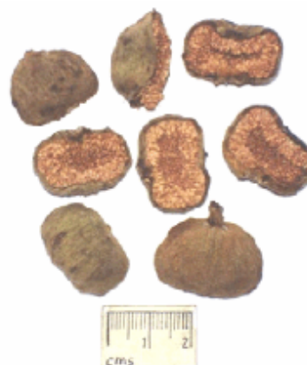
Dried fruits (longitudinally cut)