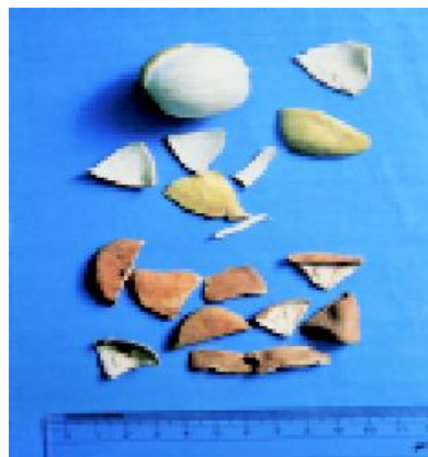
B. Dried fruit rind

Citrus aurantifolia (Christm. & Panz.) Swingle