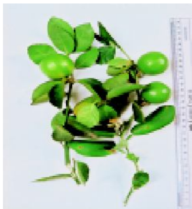
A. Flowering and fruiting twigs

Drug consists of dried fruit rind of Citrus aurantifolia (Christm. & Panz.) Swingle (syn. C. medica Linn. var. acida (Roxb.) Hook.f.) (A & B); Fam. Rutaceae. A small bushy tree found growing wild in the warm valleys along the foot hills of Himalayas from Uttranchal to Sikkim, up to 1,250 m.