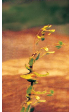
Dolichos uniflorus Lamk.