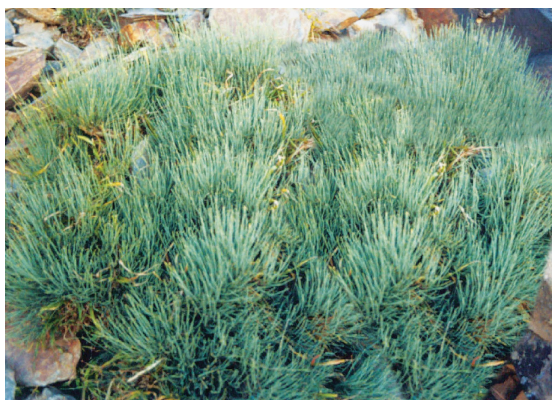
E. gerardiana Wall.