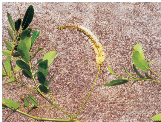
E. pursaetha DC.

Regional and Other Names Habit and Habitat Properties and Uses Ascribed Ethnobotanical studies Pharmacognostic studies Chemical studies Pharmacological and biological studies