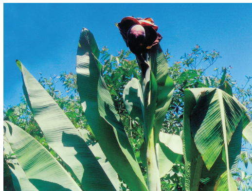
E. superbum (Roxb.) Cheesman