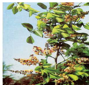
Derris indica (Lamk.) Bennet