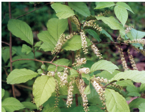
E. tsjeriam - cottam A.DC.

E. tsjeriam - cottam A.DC. syn. E. robusta C. B. Clarke, non Roxb.