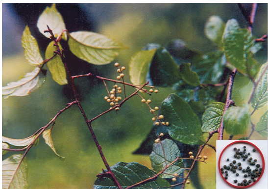
E. ribes Burm.f.